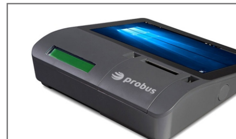
CUSTOMER DISPLAY, 240 x 48 dot

Microsoft, Windows, Intel and Realtek are the trade marks of their respective owners.